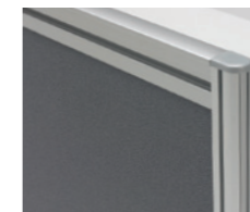
Round end post